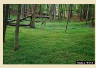
Nepalese browntop (Microstegium)