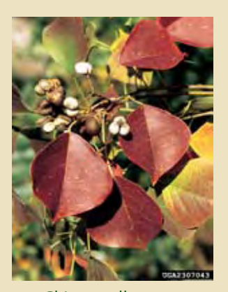
Chinese tallow tree