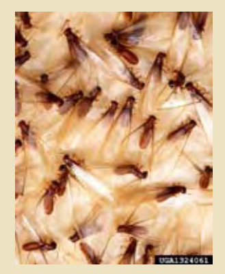
Formosan subterranean termite